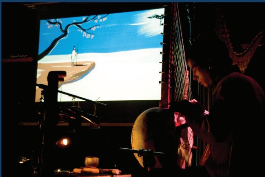
La Sorellina, Bordeaux, 2010