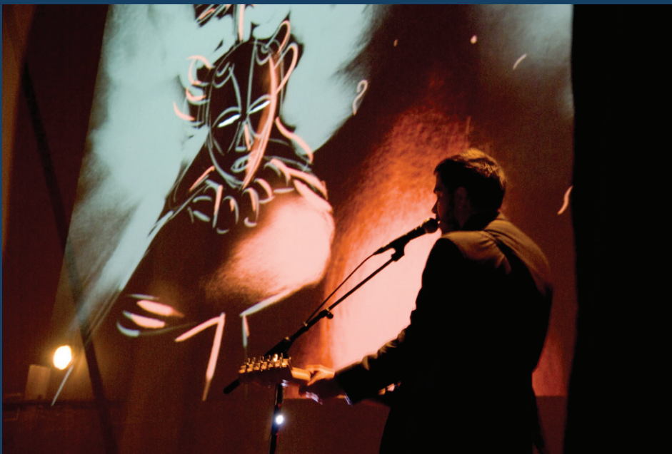
Festival International de la Bande Dessinée, 2010

The album «The Fire Within» You can listen to the album on Deezer or any download platforms.